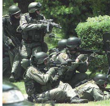
Local National Guard Called In